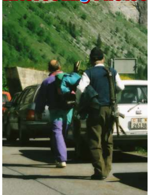
Swiss citizen taking his "assault rifle" to the shooting range on a Sunday morning.