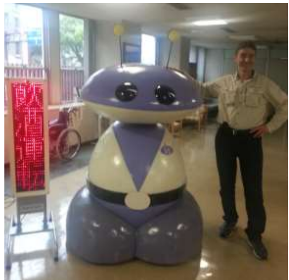
"Catch-u-kun" the alien mascot of the Nagasaki Police at Police Headquarters.