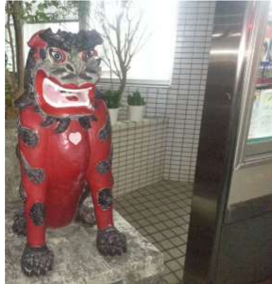
Shisa at the entrance to a police koban (post)