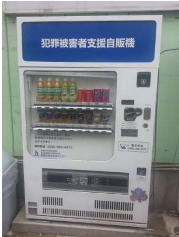
Vending Machine in Nagasaki